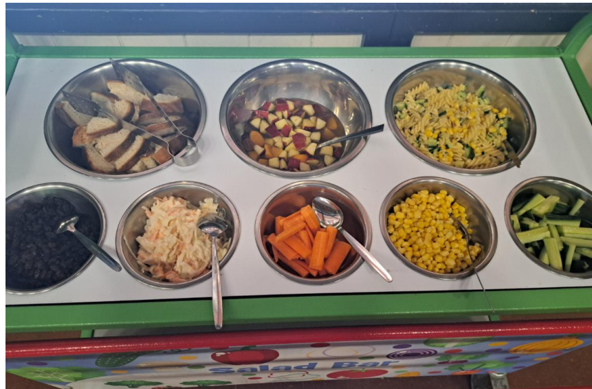
Our Salad Cart offering a variety of different options, the selection on offer changes daily!