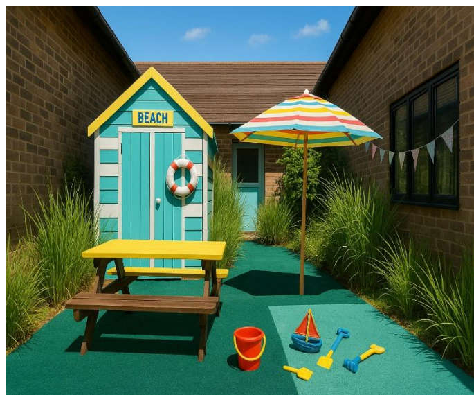
In with the new! (artist impression only!)