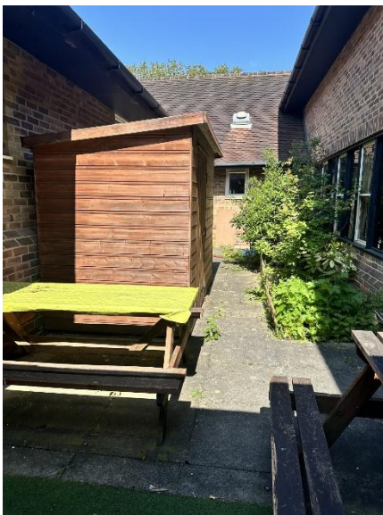
Out with the old!

We are thrilled with the money raised during our Easter Enterprise afternoon. Collectively, we raised over £1200 towards improving the small garden area in between the hall and the school office, thank you for your support. Presently, it looks a little neglected and we are looking forward to transforming the area into a relaxing 'beach-haven.' We're going to spruce up the shed and benches and will add a new planting scheme of grasses and herbs as well as outdoor rugs, a water feature and even a piece of collaborative art (more information to follow!) We think the new garden will benefit everyone in our community and children will have the chance to read and relax in the area.